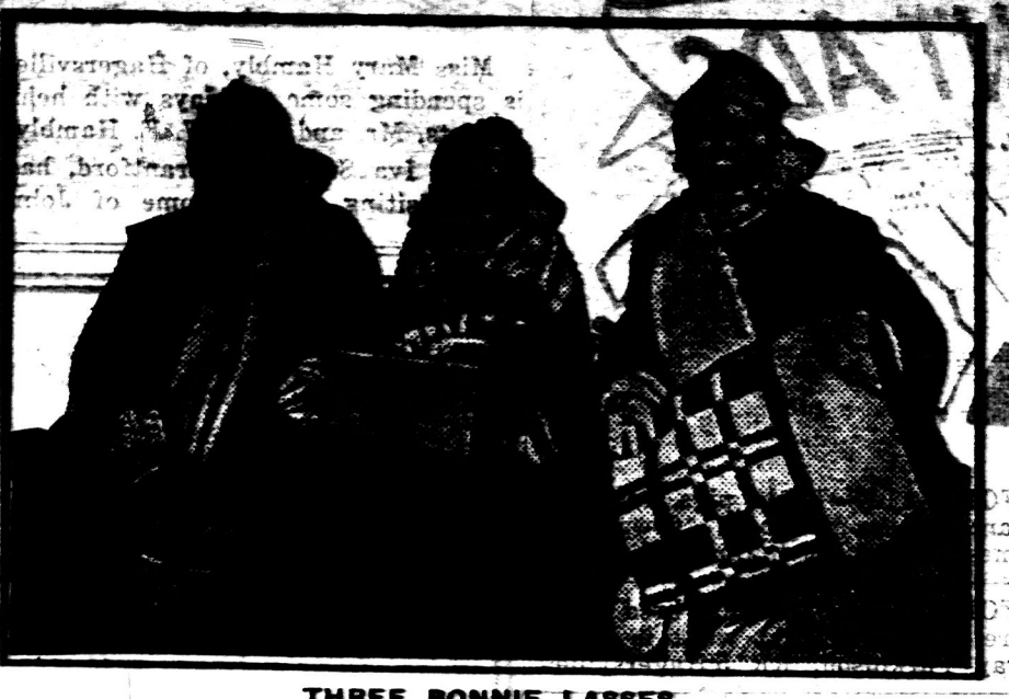
THREE BONNY LASSES Three bonny lassies, sisters all, who travelled on the "Montclair" to join Daddy at Joseph, Ontario.

Who may be afflicted with pimples and blackheads or any other facial blemish or skin trouble, are invited to write us. For 32 years we have been successfully treating Skin, Scap, Hair and Complexion Troubles, including Superficial Hair, Warts, etc. We manufacture the famous "Tollit" Preparations. Booklet "K" mailed free. MERCOTT INSTITUTE LIMITED 215 College St., Toronto