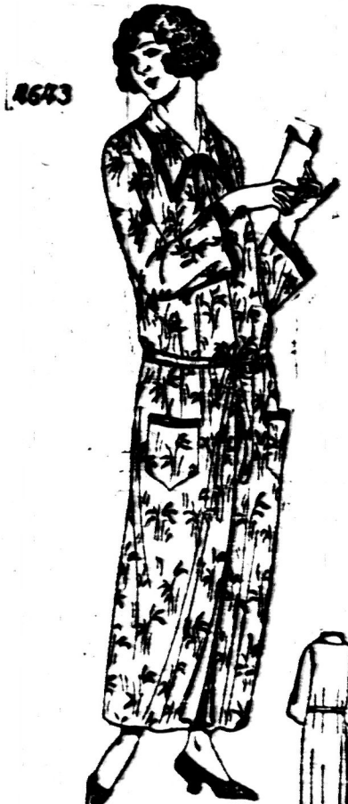
A COMFORTABLE REST OR BATH ROBE.

To renovate a window shade, tack the shade to the floor or table and go over it with a good paper cleaner, which can be purchased at most any store, or else rub it with a heavy rough flannel that has been dipped in dry starch. If the lower edge is faded, pull out the tacks and reverse the shade, tacking the lower edge to the roller and make a new hem.