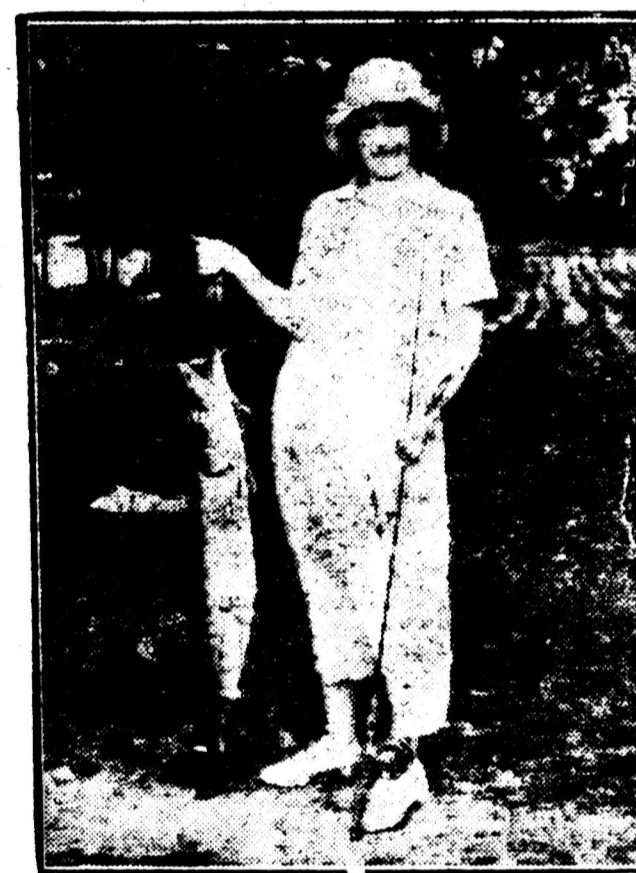
The camera doesn't lie. So this Toronto lady had her photograph taken with the sixteen-pound lunge she landed unaided in the Trent River this season, the biggest catch made by any woman.

Poultry Farmer—"You'd be surprised what a difference these incubators make. We can hatch out two or three hundred chicks every week." Dog Breeder—"Good Gracious! How ever do you manage to find names for them all?"