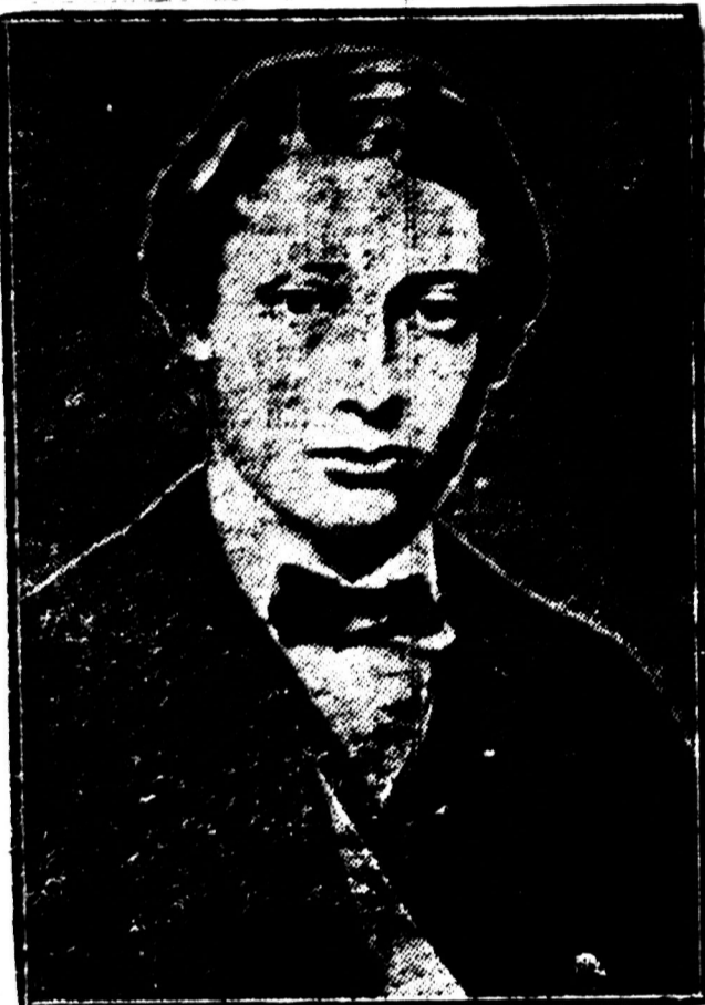
Coinciding with the presence of the Prince of Wales in the U.S., is the fact that King Edward VII, when the Prince of Wales, arrived in New York as Lord Renfrew on September 20, 1880. He is shown as photographed at that time.

Oats, Can. west, No. 2, 70c; do, No. 3, 69 1/2c; extra No. 1 feed, 68 1/2c. Flour, Man. spring wheat pats., 1sts, $8; seconds, $7.50; strong bakers', $7.30; winter pats., choice, $6 to $6.10; rolled oats, bag 90 lbs., $3.55 to $3.65. Bran, $7.25. Shorts, $9.25. Middlings, $15.25. Hay, No. 2, per ton, car lots, $16.50 to $17. Cheese—Finest wests., 17 1/2 to 17 3/4c; finest easters, 17 to 17 1/2c. Butter—No. 1 pasteurized, 36 1/2c; No. 1 creamery, 35 1/2c; seconds, 35c. Eggs—Storage extras, 42c; storage firsts, 38c; storage seconds, 30c; fresh extras, 48c.