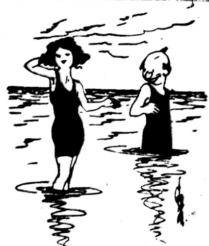
He "Class" is written all over Mabel, isn't it? She—"Yes, 'Second Class.'" There are always 20,000 strangers gazing in London.

Ambergris, derived from the intestines of the whale, is found in lumps up to 300 pounds in weight, either floating in the tropic seas or cast up on the shores of Madagascar, China and Japan. The whole of the constituents of ambergris, being of a highly complicated character, have not yet been identified and isolated. Ambergris was known in very early times, and was reputed to possess highly curative properties for certain diseases. Its present high cost is due entirely to the uncertainty of the supplies, to its use in perfumery as a fixative, and to its highly pleasant and delicate musk-like odor. Oysters are nervous creatures, and a sudden shock such as a loud thunderclap will kill hundreds of them.