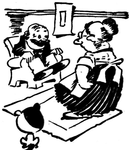
Certainly Well Trained.

Man's boldness and woman's caution make an excellent business arrangement.—Elbert Hubbard.