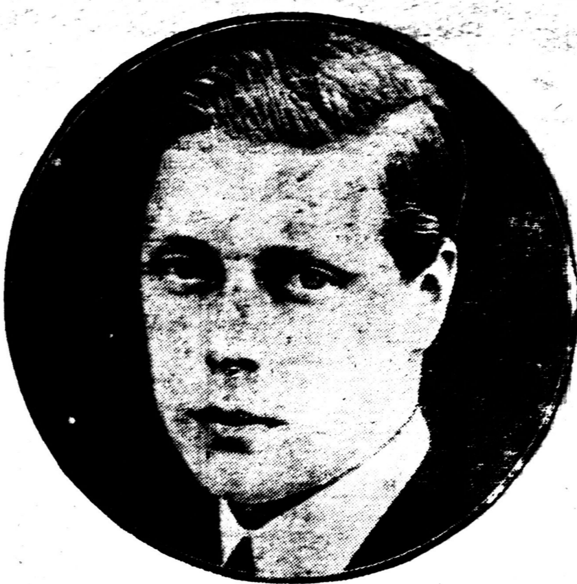
Here is one of the most recent portraits of the Prince of Wales, who is visiting his ranch in western Canada. The picture shows the forceful character and determination which is the foundation of a king.