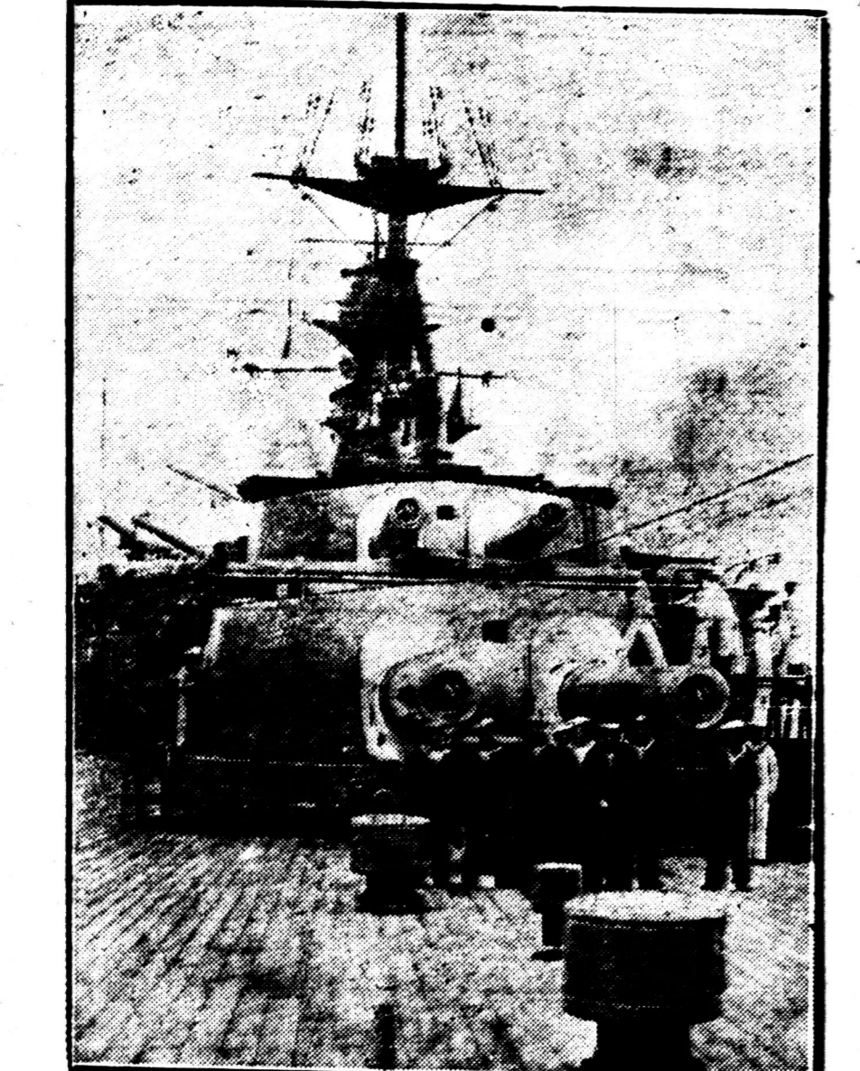
Here is shown the quarter-deck of H.M.S. Hood, giving a view of some of the "big guns" of the navy. The photograph was taken while the special service squadron was at anchor off Quebec.

A despatch from Paris says:—The Reparation Commission decided on Thursday that, during the application of the Dawes reparation plan, the Committee of Guarantees would not exercise the attributions conferred upon it by the Treaty of Versailles and by the schedule of payments of May, 1921.