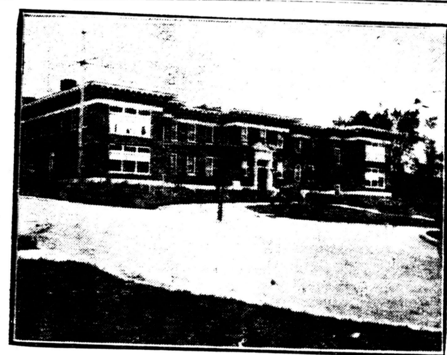
Every returned soldier in Orillia and district is entitled to free treatment for the rest of his life in this magnificent new memorial hospital. The fun for its construction was donated by the community.