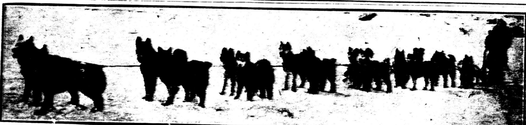
Here is shown an Alaskan dog team similar to those employed in rushing serum to stricken Nome, Alaska, fighting against the spread of hundreds of cases of diphtheria.

The pupils also are catching the complaint en masse, and from 20 to 50 per cent. of the students have been ordered to stay home.