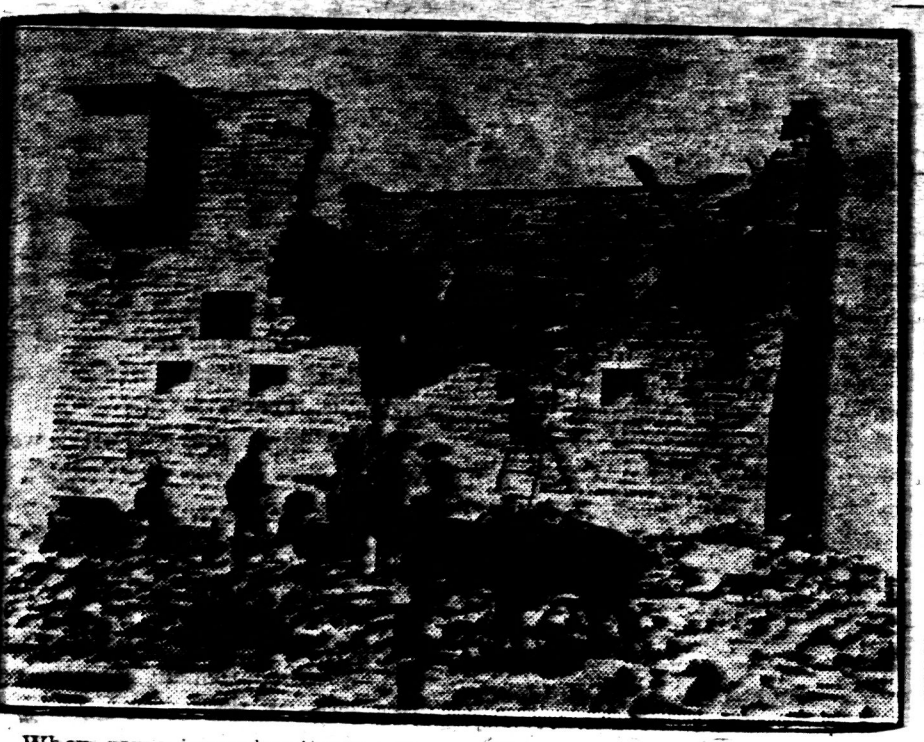
When some irregular local police mutinied at Gardai, India, they took possession of a block house and defied the world. A small British gun, however, upset their calculations and they were captured.

Victoria, B. C.—Whaling stations along the British Columbia Coast are finding business much better this year than last. Up to the present month more than 200 tons of whale oil from the stations on the Queen Charlotte Islands, have been shipped to England.