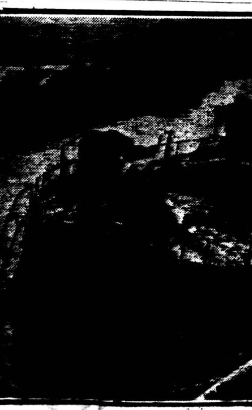
Salvaging operations being undertaken by Great Britain to raise the sunken German fleet at Scapa Flow are shown in the above photograph. The value of the fleet lies chiefly in the enormous mass of machinery and brass and copper tubing it contains.