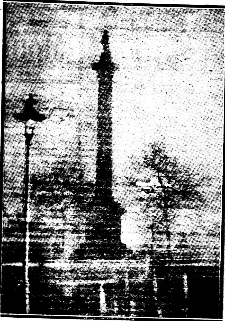
THE GREAT FOG Trafalgar Square as it appeared during the great fog which hung like a pall of gloom over London for several days recently.