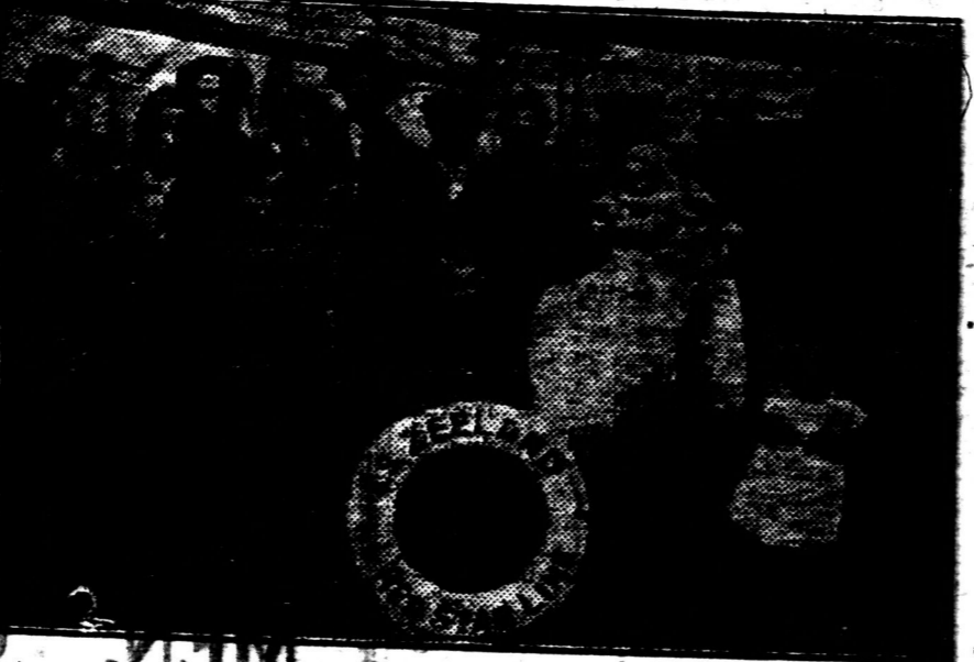
A family of Dutch Settlers recently arrived in Western Canada over Canadian National Railways after crossing from Antwerp on the S.S. Zeeland of the Red Star Line. Many settlers of this type are moving to the prairie provinces during the present season and they give promise of becoming splendid farmers.