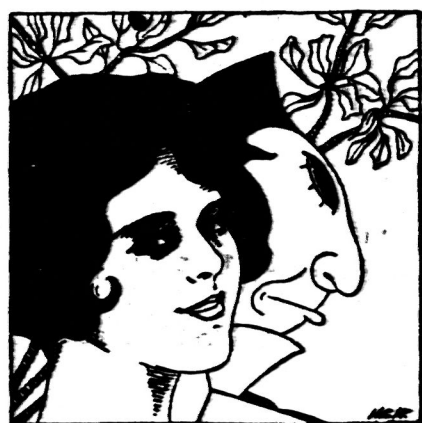
A Club Sandwich.

To teachers of grammar, an acquaintance with the old lady would be particularly beneficial. Few teachers ever know that "oved" is merely a contracted form of our grandmother's love-did; that "methinks" is not poetical English at all, but, on the contrary, Anglo-Saxon prose, and means "to me it seems"; and that, in "he went a-fishing," the a is the preposition on—"he went on fishing." In fact, nearly all our present grammatical forms come from this respectable ancestor.