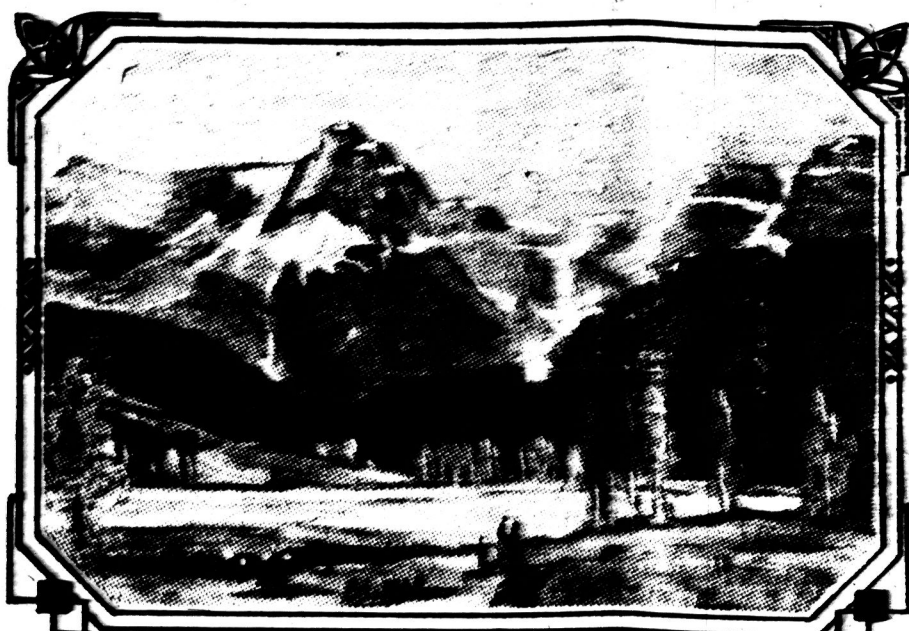
Cathedral Mountain from the Yoho Valley