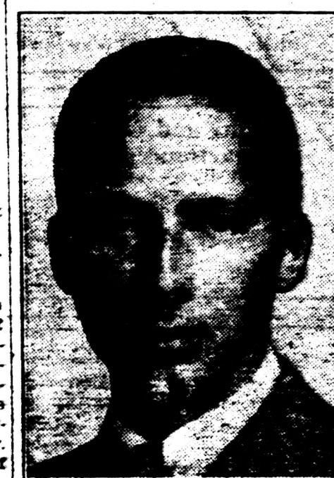
Descendant of Governor

It is easy for us to see the difference between the animals and plants around us. But it is not so easy to get down to the fundamental differences which