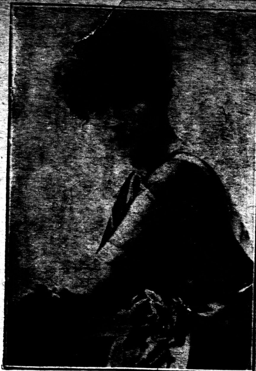
WAS FAMOUS SPY "MADAME X" DURING WAR.

Failure is only postponed success so long as courage "coaches" ambition. No one can batter down the rocks; it's the eternal pounding away of the surf, that changes the shore line. The habit of persistence is the habit of victory. —Robert Kaufman.