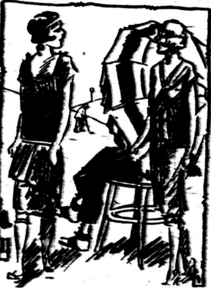
Just a Cowboy.

"Made quite a pick-up," said he. "Took a little time," I said easily. "That creek bed's a poor place to work."