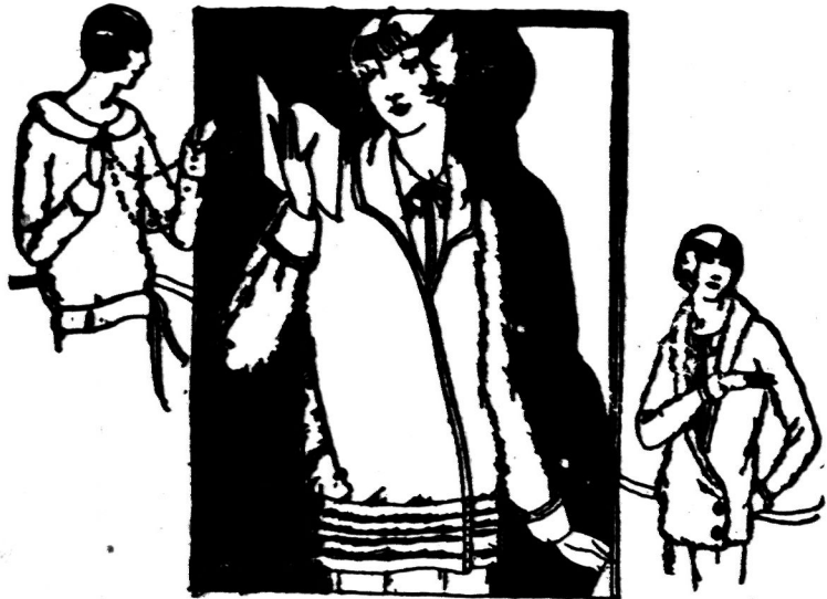
Ladies' Brushed Wool Chappie Coats, full size collar. Values up to $6.50

We have been planning for months for this great sale event. We open this great sale event on Friday, Jan. 29th. We list in this advertisement many of the special prices that go on sale, however, printer's ink cannot tell the half of the story, space will not permit. We will have many surprise bargains for you. If you cannot come to us we will come to you. Shop by mail or phone, no extra charge for shipping. We will gladly submit samples and prices and with our wonderful buying connections, and paying cash, we are in a position to offer you prices that cannot be duplicated and our guarantee goes with every article that we sell. The builders are now at work finishing our 3rd floor. Full announcement regarding this new 4th floor department about Feb. 15th.