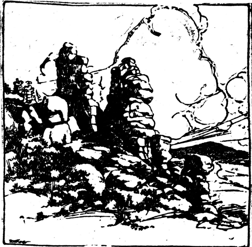
These formations of granite rock exposed on a hill-side in the Mourne Mountains, Ireland, show how the hills are worn away by the elements. The formations sketched here are known by the picturesque title of "The Castles of Kivvitar."

Everlasting Hills Exist Only in the Language of the Poets.