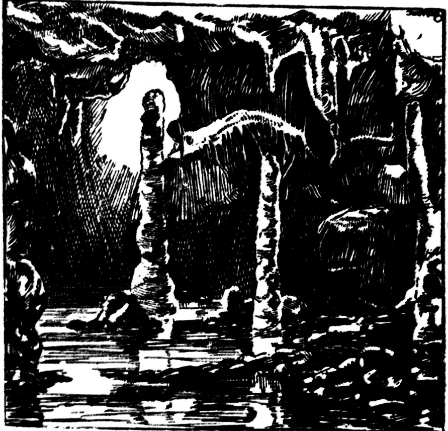
The sketch shows the interior of a cave in Somersetshire, England, known as Cox's Cave. Note the stalactites hanging from the roof and the stalagmites growing up from the floor. These are the results of water saturated with carbonate of lime dripping through the roof.

Secrets of Science. By David Dietz. The sun shining down upon the ocean, heats the surface. Some of the water is evaporated and passes into the atmosphere as water vapor. Winds blow the water vapor over the land, upon which it falls in the form of rain. Part of the rain soaks into the ground. The rest runs down the slope of the land forming rills in the depressions in the land. These unite to form larger streams. When they reach the valleys, they form still larger streams, known as creeks and brooks when small, and rivers when large. Rivers are among the chief agents which wear away the land. The flowing water wears away the sides and bottom of the valley through which it flows. The sediment thus formed and the sediment washed into the river by the rain, increases its power to wear away the valley since each particle of sediment acts as a cutting tool against the river's bed. Rivers are the great transportation agent. The current carries along the sediment in the river. It is estimated that the Mississippi River annually carries enough silt material into the Gulf of Mexico to make a column one mile square and 288 feet high. Not all the material which a river carries in suspension reaches the ocean. Streams which overflow their banks at times of the year, such as the Nile, deposit much sediment upon the banks of the river as the flood recedes. These deposits are known as flood plains. Many rivers, such as the Mississippi, deposit much material at their mouths.