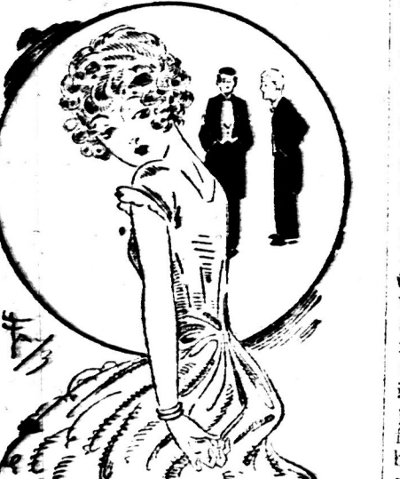
No Trouble to Turn. "She has a head like a doorknob." "How come?" "Any man can turn it."