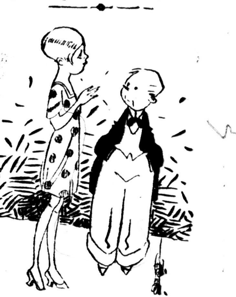
She: "Does my nose shine, dear?" He: "A trifle—but it's such a tiny little nose, no one would notice it."