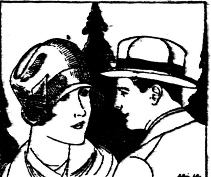
Sheik and Chic.

Mornings in Our Yard the clover prairie sparkled with a million gems. Strung on a blade of grass you found a necklace of diamonds. . . . When supper was over a bonfire blazed in the western sky, just over the fence. The clouds built it, you explained to Lizbeth, to keep themselves warm at night. . . . When the moon shone you could see through the window by your bed the clover prairie and the trellis mountains, silver and gold with fairies—you could see their lanterns twinkling in the trees. From "In the Morning Glow," by Rolfe Gilson.