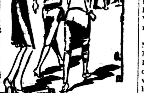
"The chaperone has just told the girls she thought those horrid boys were telling riddle jokes."

The disclosure of the results of his study were made by Mr. Edison to a party of railroad men who visited the West Orange laboratories. Mr. Edison, who was engaged in research, stopped long enough to explain his work.