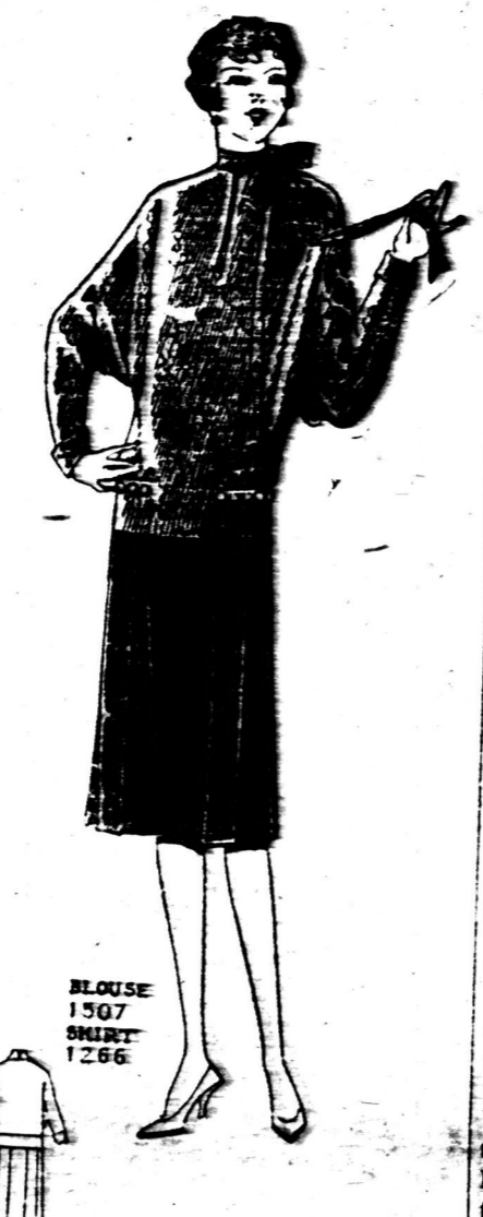
MODELS 1267 1268 1266

A MODISH BLOUSE AND SMART BOX-PLAID SKIRT. The attractive blouse shown here has the fashionable dolman sleeves finished with flared cuffs, a collar having long ends which may be tied as illustrated, or left open with the ends falling gracefully in front. The sides and back of the blouse are slightly gathered to a band and buttons adorn the sides. No. 1267 is for ladies and is in sizes 34, 36, 38, 40 and 42 inches bust. Size 36 requires 2 1/2 yards 39-inch material, or 1 1/2 yards 54-inch. Price 20 cents the pattern. The skirt, having two box-plaits at front and back, is joined to a dart-fitted bodice top. No. 1266 is for ladies and is in sizes 34, 36, 38, 40 and 42 inches bust. Size 36 requires 1 1/2 yards 36-inch material for the skirt, and 1 1/4 yards for bodice top. Price 20 cents the pattern. Our Fashion Book, illustrating the newest and most practical styles, will be of interest to every home dress-maker. Price of the book 10 cents the copy.