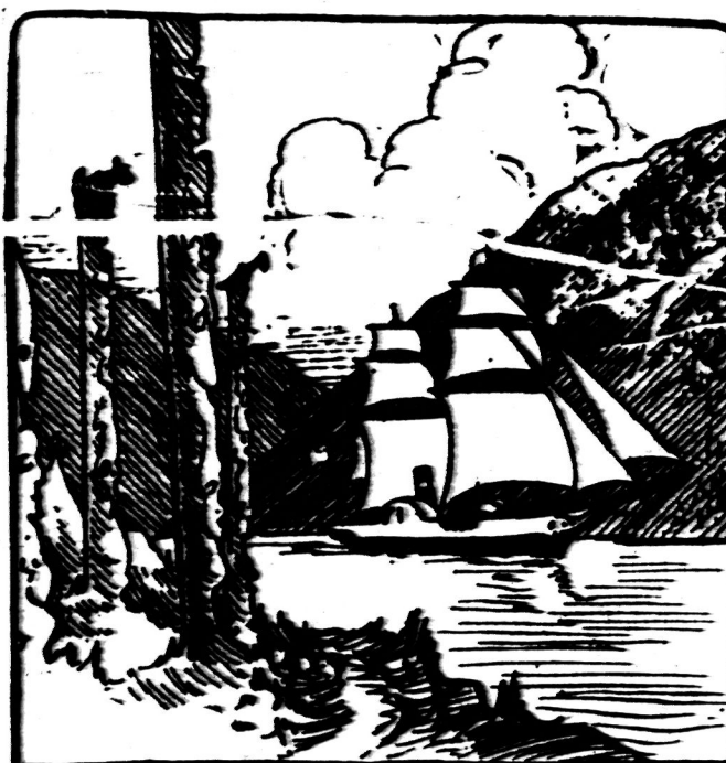
STEAM AND SAIL TRADER ON PACIFIC COAST