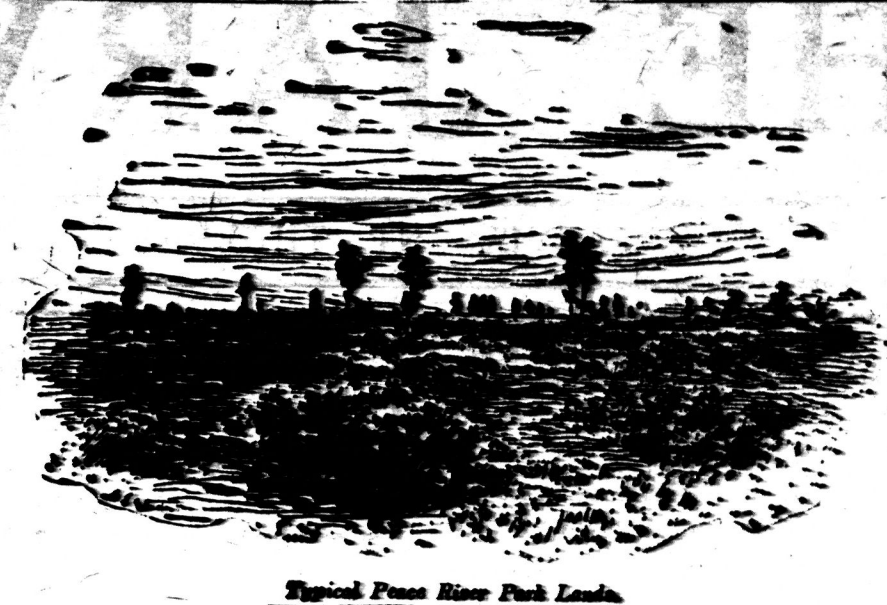
Typical Peace River Park Land.

Samuel proceeds to reason with the people. He recalls well known facts of their early history, the deliverance from Egyptian bondage, and repeated deliverances in the days of the judges, and exhorts them to "fear the Lord, and serve him, and obey his voice," v. 14. The story of Sisera is told in Judges, chs. 4 and 5. He was the commander of a Canaanite army, whose stronghold was at Hazor, in the northern part of Palestine. The story of the Philistine oppression, of that of Moab and of Ammon, is also told in the book of Judges, of the deliverances mentioned whom God raised up; Jerubbaal is better known as Gideon, and Bedan is otherwise unknown. For "Bedan" the ancient Greek and Syriac translations have "Barak" and that is probably correct. See his story in the previous story in which the demand for a king preceded the Ammonite invasion (compare 8:4 and 11:1). But it is quite possible that the name of Jesh-Gilead was the last of a series of warlike invasions by the Ammonites, and that we have in this fact, and not in the fear of a Philistine invasion, the reason for the desire to have a king to lead their united forces