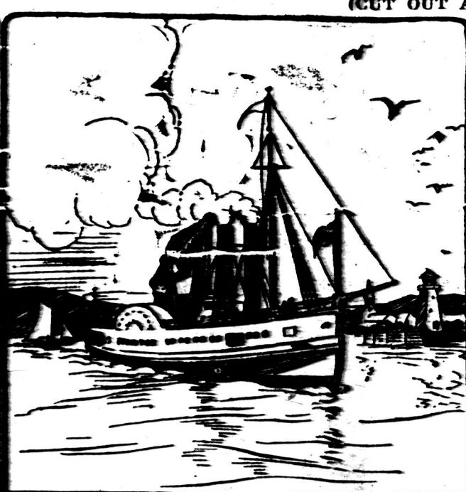
BEAM ENGINE VESSEL ON GREAT LAKES