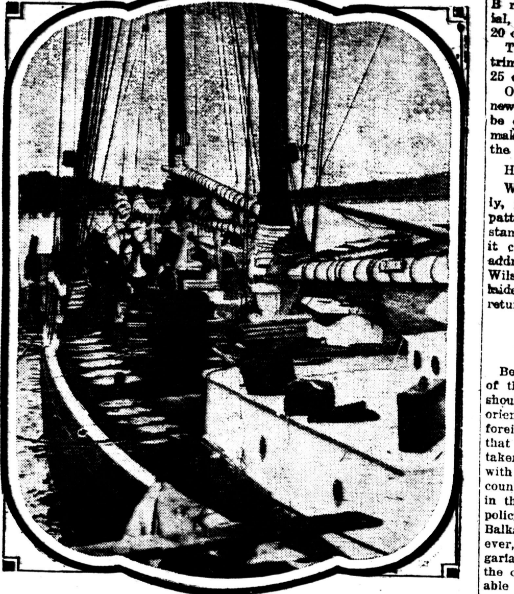
MACMILLAN OFF FOR THE ARCTIC The loaded deck of the schooner Radio when it was being stocked to take Commander Donald B. MacMillan and ten scientists on their five-year expedition into the Arctic.