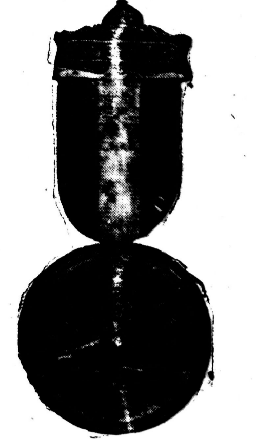
The British Empire Union medal symbol of the empire, which is to be widely distributed to school children on Empire Day.

London.—Newfoundland's claim to ownership of territory in the Labrador peninsula is sustained in substance, with two reservations.