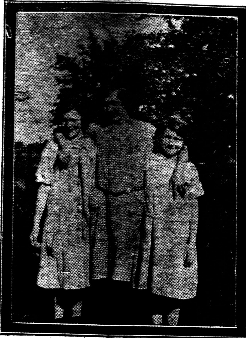
The Winner and Her Sisters