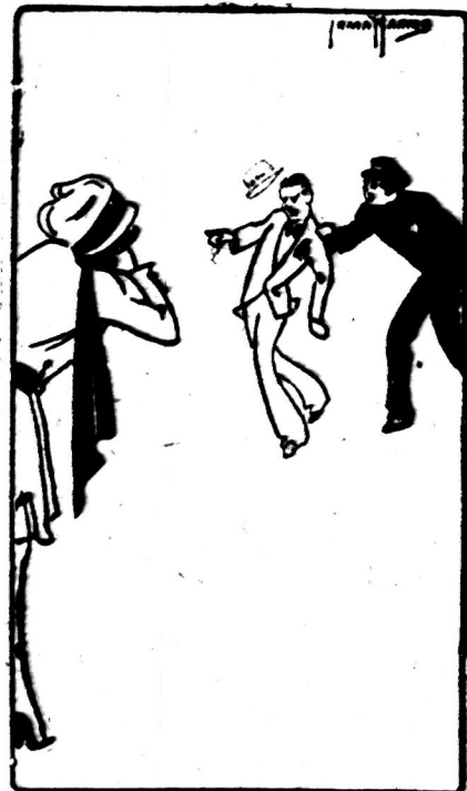
"Arrest is more certain if you lie in hard language than in a soft bed."