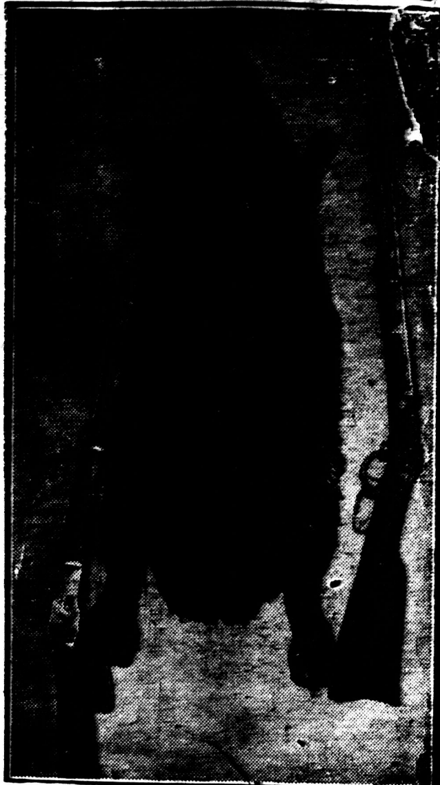
IT'S NO GOOD TO THE TRAPPER This Northern Ontario Beaver pelt shows that however useful his tail may be to the beaver its no good to the trapper.