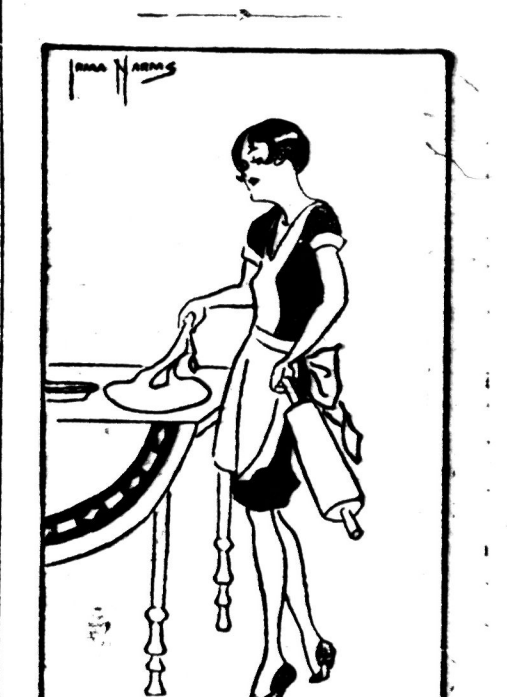
"A pie can be stretched farther when the dough is elastic."

London Morning Post (Cons.): That progressive saving of ten millions a year which Mr. Churchill talked of when he assumed office is much overdue. Instead, the country has seen both expenditure and indebtedness going up, until it begins to despair of any relief from burdens well-nigh not to be borne. If this is done in the green tree of a Conservative Administration, what will not be done in the dry tree of Socialism? That is the question that is presenting itself to the public mind; and that is the question which should preoccupy the Ministerial mind, for on success in grappling with this need for economy, the credit of the Government will be established or destroyed.