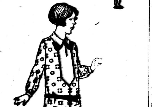
A SMARTLY SIMPLE FROCK FOR THE JUNIOR MISS.

Vs. 15, 16. So Jesus points his disciples to the example of the children and says that even grown men may take a lesson in righteousness from them. Only they who recover the childlike spirit can find their way into the possession of God's kingdom. We must all in the things of God begin at the beginning like the children.