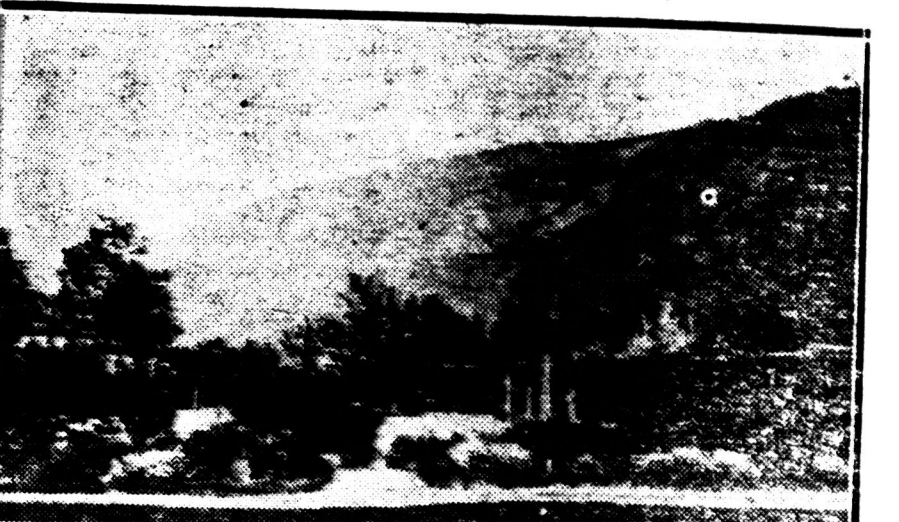
GARDEN LOOKING NORTH