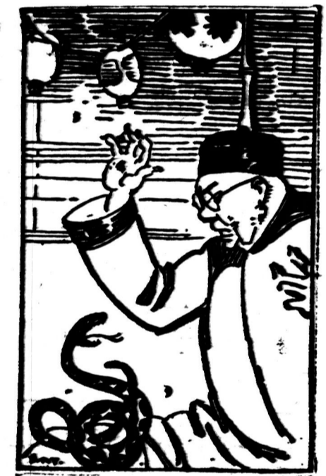
The metal case lay open, displaying the writhing body of a snake.

her trembling fingers, and then she knew that she was lying, face-downward, in a long cane chair, sobbing as if her heart would break.