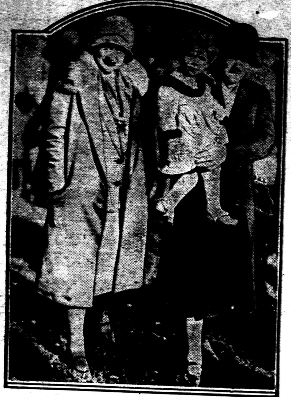
CURL HEADED PRINCESS TAKING IN THE HUNT Princess Elizabeth, daughter of the Duke and Duchess of York, with her mother and her nurse, at a meeting in Yorkshire, her first appearance in the hunting field.

one teaspoon cracker crumbs, salt, pepper, celery salt. Split the tenderloin. Season with salt and pepper. Make a dressing with the oyster, crackers, and season with salt, pepper, and celery salt. Spread part of the one tenderloin with dressing. Put the other one-half tenderloin on top. Spread with more dressing. Tie together with string and bake. Baste often.