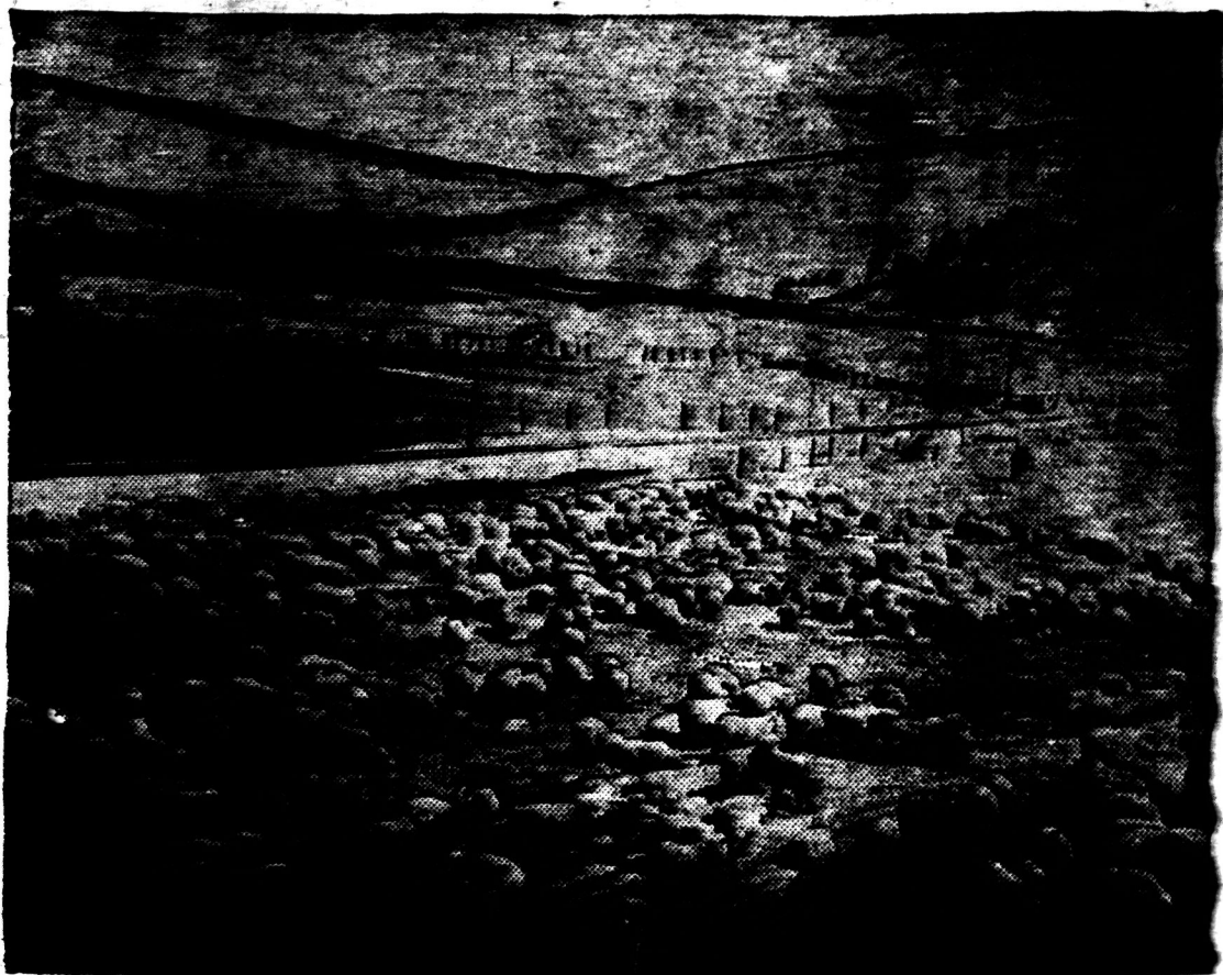
THE GOLDEN FLEECE IN WESTERN CANADA In the foothills of the Rockies the fostering of the breeding of Merino crossbred sheep for their wool production is one of the keen interests of the government of Alberta. This scene was taken on a ranch not far from Calgary.