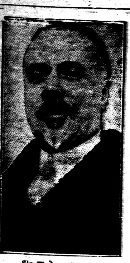
Sir Thomas Beecham Conductor and director of the Imperial Opera League of London, visiting the United States to conduct the orchestras of the New York Philharmonic Society, the Boston and Philadelphia Symphonies.

British Golfers Ask Freedom for the 'Nineteenth Hole' London—A meeting of the Executive Council of the Golf Clubs Protective Association here decided unanimously to petition the Government to remove restrictions on the "nineteenth hole" enforced since the war under the Defense of the Realm Act, limiting the hours wherein intoxicants can be sold. The Golfers' Association follows numerous others in attacking continuation of the wartime restriction. The Daily Express began recently to display a series of little comments on the absurdities of the law, which is nicknamed Dora. It gives this instance: "You can buy soda water up to 10 p.m. to-day and 9.30 p.m. on other week-days, but you cannot buy milk after 9 p.m. to-day or 8 p.m. on other week-days."