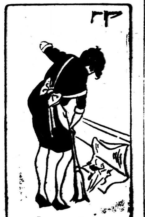
"When cremation becomes more popular, probably a dust pan will replace the skeleton in the closet."