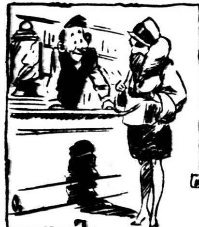
HER PREFERENCE "Madam, do you like the Cinema?" "Well, yes, I do, but I believe I like the peppermint better."

Some of the British professionals plan to compete in the United States open championship this summer, and it will be up to the American's to show them the same fine sportsmanship which they have just received.—Editorial in Christian Science Monitor.