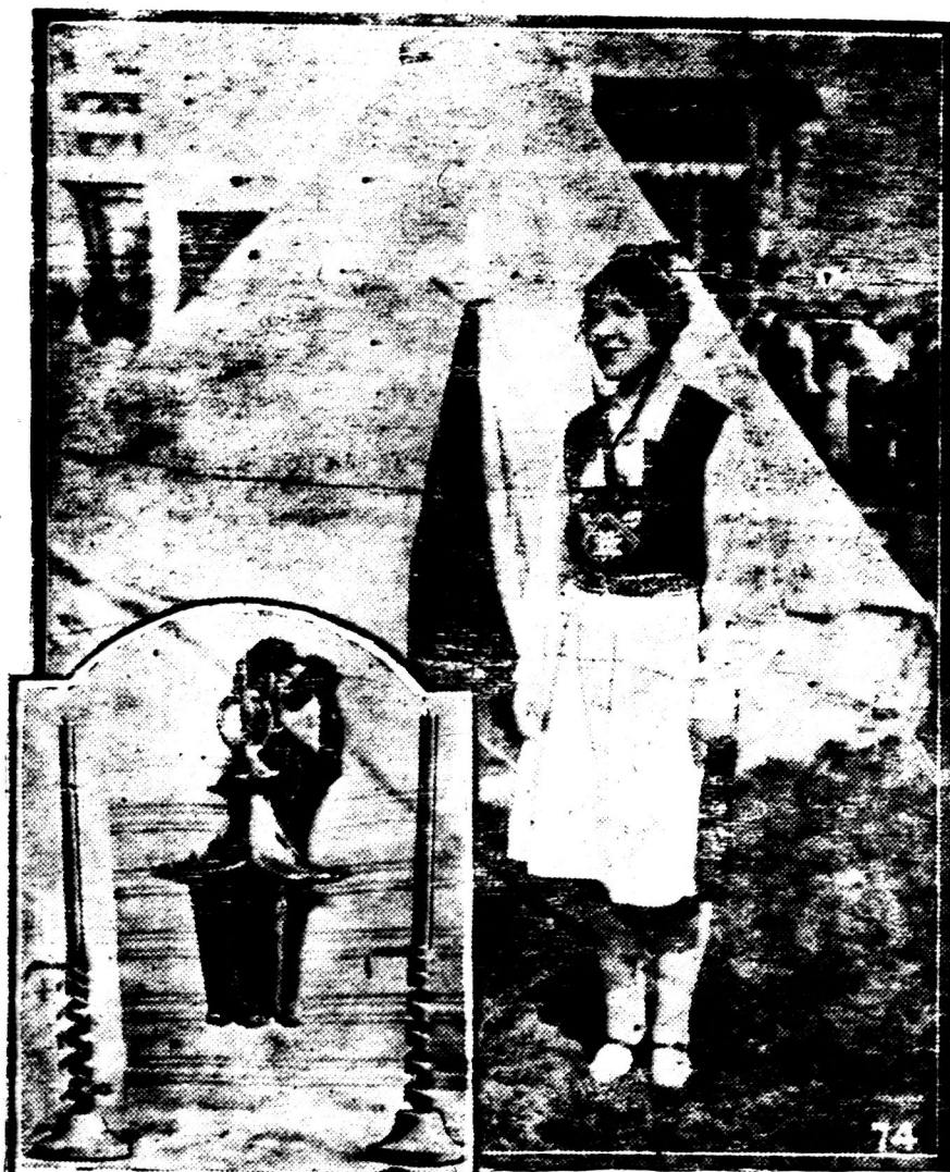
1. In the costume of her homeland as she will appear at the festival. 2. An example of Norse handicraft.