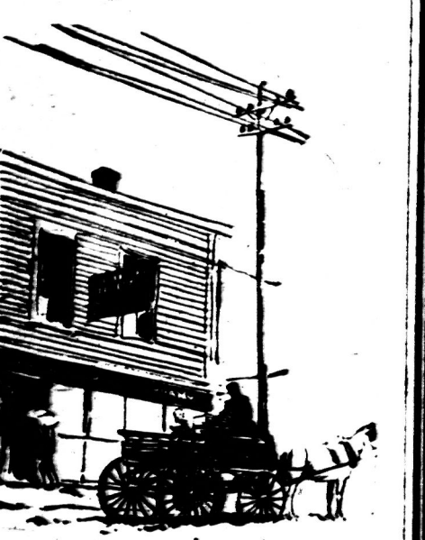
First general office of the Dominion Express Co. Winnipeg 1882.

the purpose for which they were made In 1884 operations were extended from Rat Portage to Port Arthur and a traffic route formed using steamers between Owen Sound and Prince Arthur's Landing as Port Arthur was then called. This arrangement con- tinued until the eastern and western lines of the company were joined on the north shore of Lake Superior.