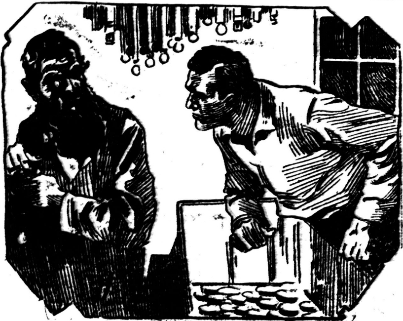
"DON'T BE FUNNY. HOW MUCH?"

"He says I'm not even worth shanghaiing! Caesar! I'd like to argue that with him!" But how? Drake took steps to peep outside again, if he could just catch Mister Stevens alone for a moment, with that girl out of the way, he would see. The big blond beast might batter a clumsy customer like the crimp, slow moving, slow thinking, a creature of one idea. But Drake had known the day when he could handle himself