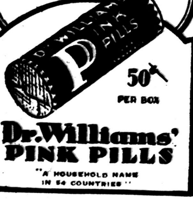
Dr. Williams' PINK PILLS