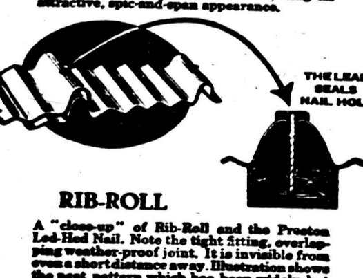
RIB-ROLL A "close-up" of Rib-Roll and the Preston Lead-Hed Nail. Note the tight fitting, overlapping weather-proof joints. It is impossible from even a short distance away. Illustration shows the best pattern which has been widely but unsuccessfully copied.

MODERN BUILDING—for permanence, low-upkeep and appearance—sounds the death-knell of wooden roofs. The dangers of fire to the building itself, to other buildings and to human life is rapidly being banished by metal roofs of high quality.