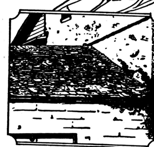
Old roofs like this are rapidly becoming things of the past. Fireproof, permanent, Rib Roll roofs mean lower insurance rates, banish upkeep trouble and give your building an attractive, up-to-date appearance.