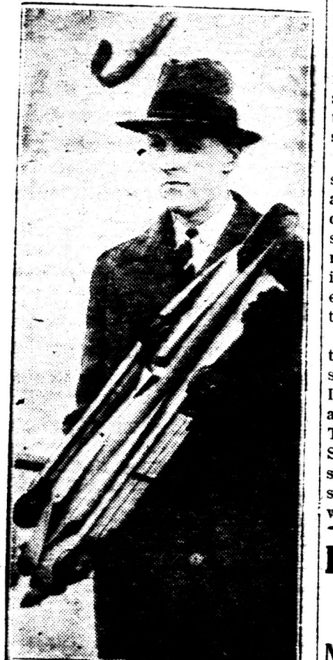
SPEED KING ARRIVES Major H. O. D. Seagrave recently arrived in New York en route to Florida, where he will attempt to break more records with the "Golden Arrow" and "Miss England."

London—David Lloyd George, who has just returned from abroad, buried the epigrams of old-fashioned oratory against the Conservative Government in his recent opening speech which many observers believe may foreshadow the return to power of the fiery, little Liberal party leader. Thunderous applause greeted the former premier as he sounded a stirring keynote for his party in the coming general election stressing the issue of unemployment and the decline of agriculture during the Conservative party regime. The white-haired little Welshman held his audience of 300, including 448 prospective candidates, spellbound in Connaught Rooms as he worked up to a climax in his assault—reaching probably the greatest oratorical heights of his career. Vigorous stamping of feet, shouts, and cheers greeted the Lloyd George epigrams as he promised to reduce unemployment to normal—a vital issue in the coming election—if the Liberal party is victorious.