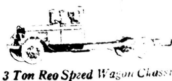
3 Ton Reo Speed Wagon Class

Medium and Heavy Hauling Like Men Have Never Known Before