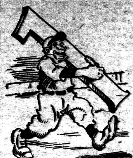
Whose going to get first place at Jarvis, May 24th? Four Big teams.