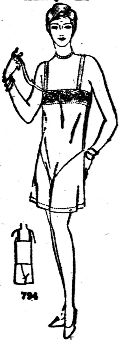
No. 794. Designed in sizes 16, 18, 20 years, and 36, 38, 40 and 42 inches bust.

gods and against evil-doing of every kind, vs. 14, 15. Compensatory idolatry in chs. 2, 3 and 10, and of other forms of evil-doing in chs. 7, 9, 22, etc. It is because of this infidelity and disobedience, the prophet declares, that God is about to bring upon Judah the great calamities which he has foretold, v. 17. And because of their obedience God will bestow such blessing upon the Rechabites that that tribe shall never want a man to stand before him. How this promise was fulfilled to them in their subsequent history we do not know. One hundred and fifty and more years later a member of this tribe, Maichiah, the son of Rechab, helped Nehemiah rebuild the walls of Jerusalem, Neh. 3: 14. The first historian of the Christian church, Hegesippus (quoted by Eusebius), writing in the second century A.D., mentions "priests and sons of Rechab" as living in New Testament times. The true sons of Rechab, or Rechabites, however, are those in every age who are willing for conscience sake to stand apart from customs of their time, and to abstain from indulgences of any kind which they believe to be harmful, who preserve with high resolve and pure motive, clean and healthy traditions of a past of which they are not ashamed.