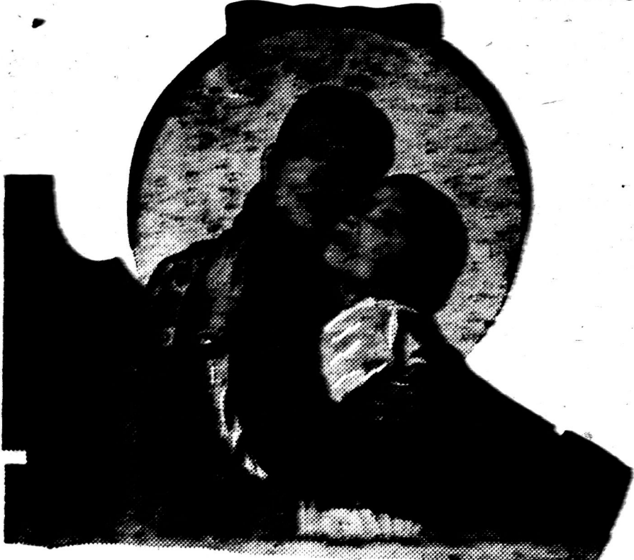
SCENE FROM "THE PATSY"