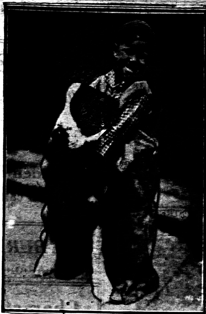
"Me and My Dog"

"Haiti is one of the most densely populated areas in the world. Though it is but one-third the size of the Dominion Republic, it has more than three times the population. While the natives are quite picturesque and very interesting, to one engaged in nature study they are sometimes extremely annoying. Wherever we went there was a gang following to see what was