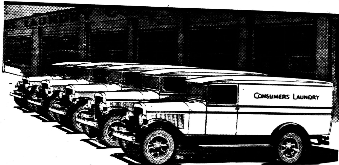
There's a Speed Wagon capacity for every hauling need—Wheelbase sizes up to 210 inches

unless they are grouped under efficient directive organization with power to act on their behalf in connection with petitioning the Government for subsidies, elimination of duplication in air transportation and also to encourage better conditions in the Canadian aviation schools.