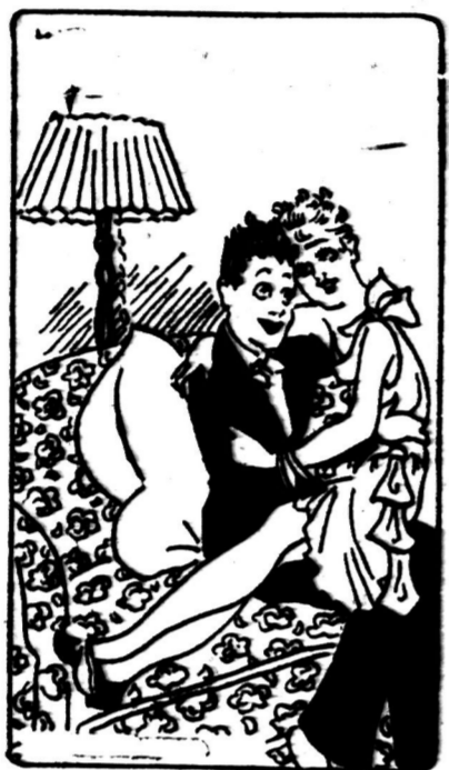
"Necking may be pronounced innocent, but it's not spelled that way."

Melbourne Argus: This Rotherbrooke Empire, as it might be called portmanteau-wise, after the fashion of Lewis Carroll, is at present impossible, if only because of Australian policy. A country which prohibits the export of stud sheep to South Africa and plunders its own people while selling sugar and butter cheaply to foreigners is a long way from being in that state of grace which the United Empire requires. Australia will have to be born again to discover that kingdom.