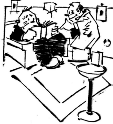
"Say, this novel is all bound wrong. It starts with the last chapter and ends with the first."

For they who can come through this—and, as I say, there can only be a few—what can there be that they could not come through? And so I see in old Europe a new and commanding breed rising up, fearless and fabulous, unsparring of blood and sparing of pity laured to suffering the worst and to inflicting it and ready to stake all to attain their ends—a race that builds machines and trusts to machines, to whom machines are not soulless iron, but engines of might which it controls with cold reason and hot blood."