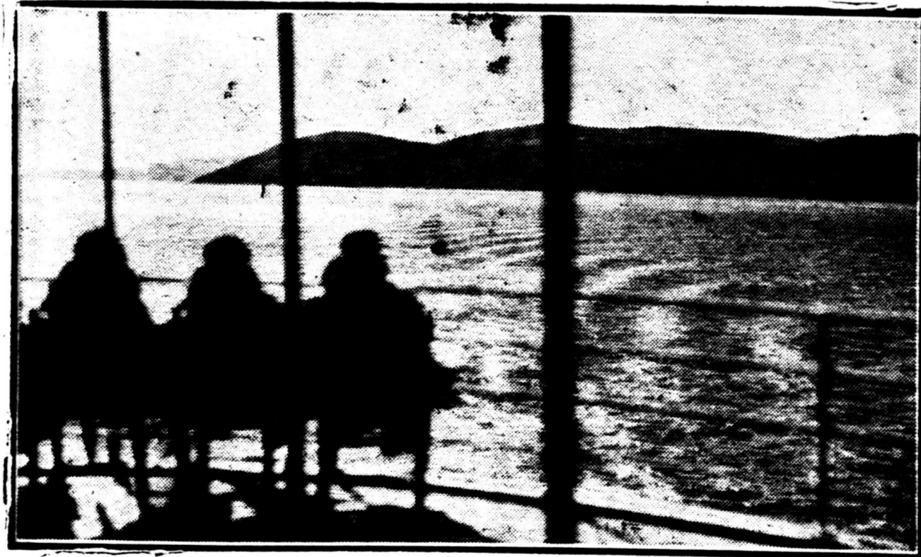
Lake and river travel remain to Canadians the complete and perfect holiday. From Niagara, Toronto and Kingston the holiday ships move to the lower St. Lawrence and Saguenay rivers. This glimpse of the Laurentians and the lower St. Lawrence is typical of the summer days on these famous trips.