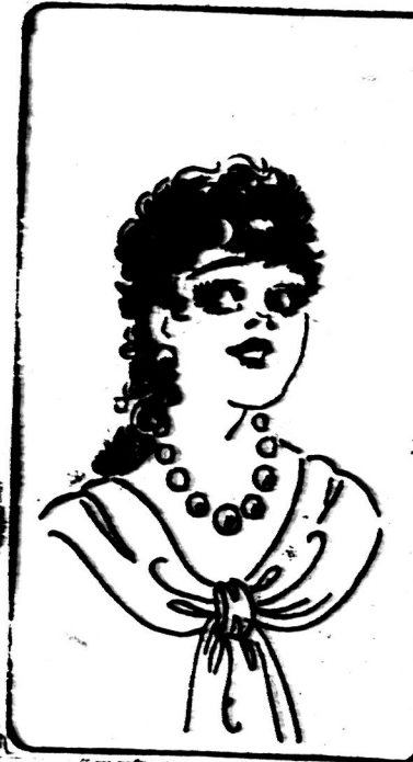
"It's generally a pretty girl who's easy on the eye."

The little set in the suburban avenue had long decided that Browne was over-proud of his bargain in the second-hand car market, and that something must be done to damp his aggressive enthusiasm. Robinson, one of the set, was on his way to the city one day when he met Browne in his second-hand car. "I'm going to the station," said the car-owner. "Would you like a lift?" "No, thanks," said Robinson, seizing his chance. "I'm in rather a hurry."