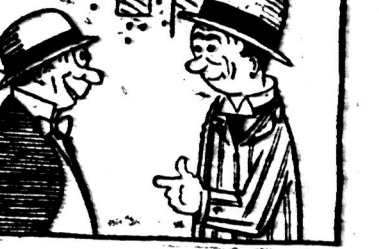
"What do you consider the first sign of advancing age?" "Getting mad when anybody calls you old."

Famous singers always travel in style. McCormack has several attendants, including an Italian chef, and always has a tank of special drinking water with him. Challapin travels with an interpreter, two secretaries, and his own "wine cellar." Galli-Curci, the famous soprano, has a suite of more than fifteen persons. For Dry Skin—Minard's Liniment. Curates are said to be drifting after training in Wales into England, where stipends are higher and the prospects of advancement are better.