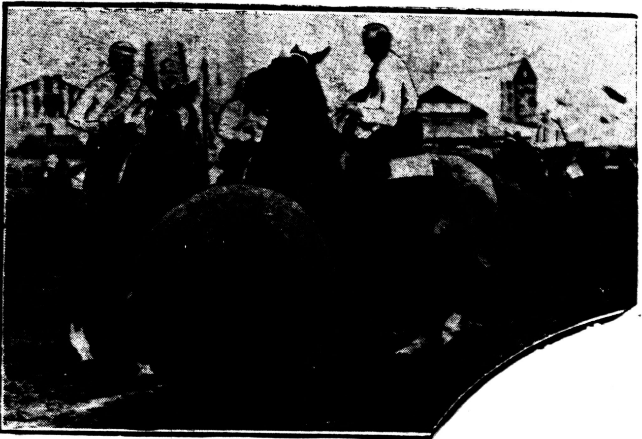
New form of soccer was introduced for the first time at the recent Berlin, Germany, horse show. It is called saddle-soccer and the feet of the riders are used to propel the ball along to the goal.