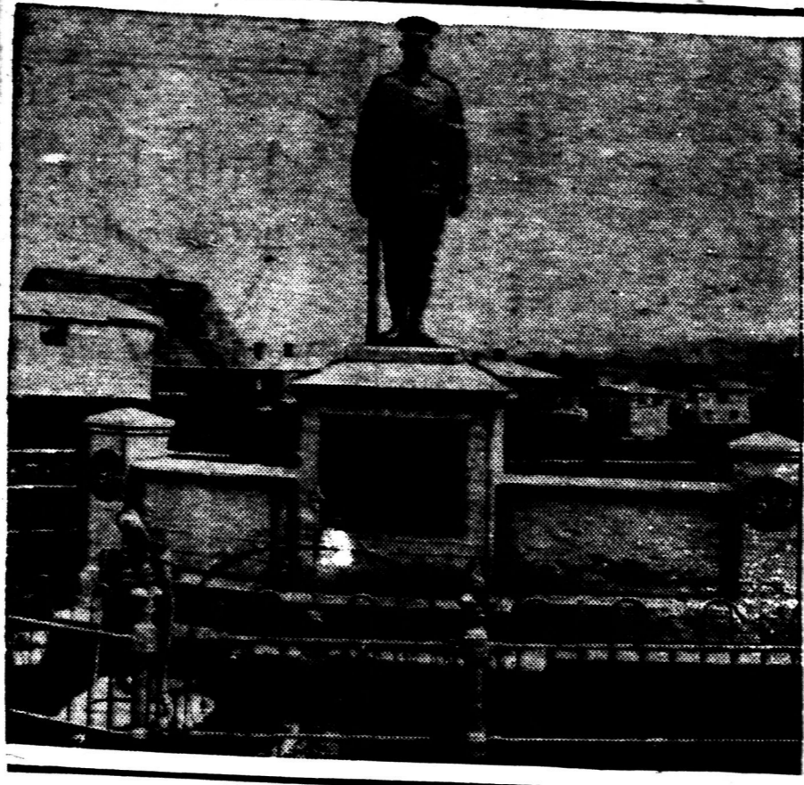
The photograph reproduced above shows an interesting view of impressive memorial to Newfoundland's war dead at Grand Bank