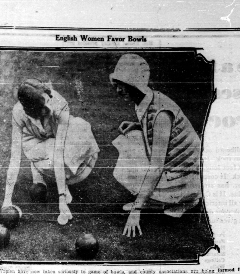
Women have now taken seriously to game of bowls, and county associations are being formed for the purpose.

An amusing account of her interview with King Albert of Belgium in the early days of the World War is given by Mary Roberts Rinehart (the "Vivandaise" of "My Story"). She was escorted to the villa where the King was staying by a Belgian general who had a heavy cold. "You will go," he directed her, "before His Majesty has spoken. Do not sit down before he so remarks. Also it is obligatory that you should go to the door." A Memory From the trenches in France, Rupert Brooke wrote this "sweet memory of the home." These have I loved: White plates and cups, clean gleam; Rings with blue lines; The strong crust; Of friendly bread; and many tasting food.